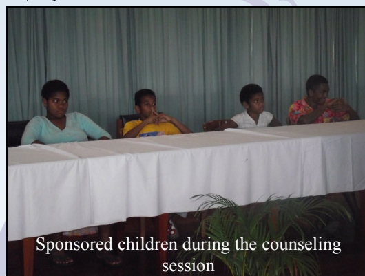
Sponsored children during the counseling session

Most parents really care a lot about their kids, but a lot of them are so stressed, they have so many other problems that they're dealing with, that sometimes the children aren't the main focus.