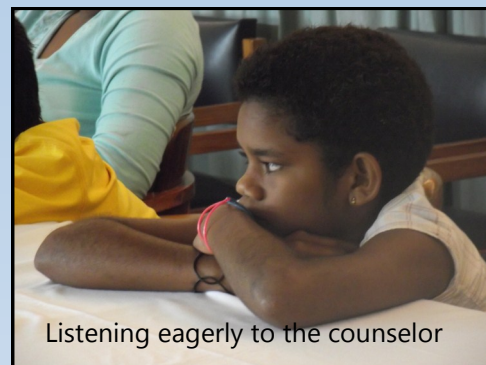
Listening eagerly to the counselor

Led by our Programme Officer and volunteers, we documented some of the experiences of the poorest of the poor children and their parents. As rapport continued to build during the session and children became more comfortable, they began to relate how they felt and offered more of an explanation about their personal situation and performance at school. Most children cited personal barriers, time management, and raised concern that parents' unrealistic expectations at home and at school created stress and performance anxiety. Some children worry about their added responsibilities at home – of caregiving and facilitating income-generating activities.